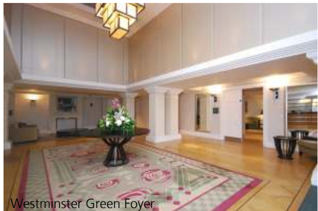
Westminster Green Foyer