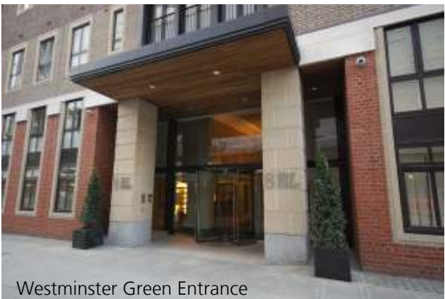
Westminster Green Entrance